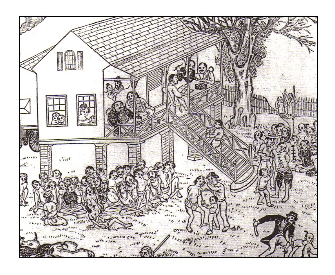
Lesson 3 Student Handout 3.8—Colonialism's Upstairs and Downstairs

As the slave trade began to dry up in the mid-nineteenth century, migratory indentured labor, mostly from India and China, came to replace it. This drawing was made by a Chinese laborer in the second half of the century. It shows a sugar estate that produced for export in a European-dominated area. What conclusions can be drawn about the power-relationships between the people shown? What symbolic ways of expressing and reinforcing power relations can be seen?