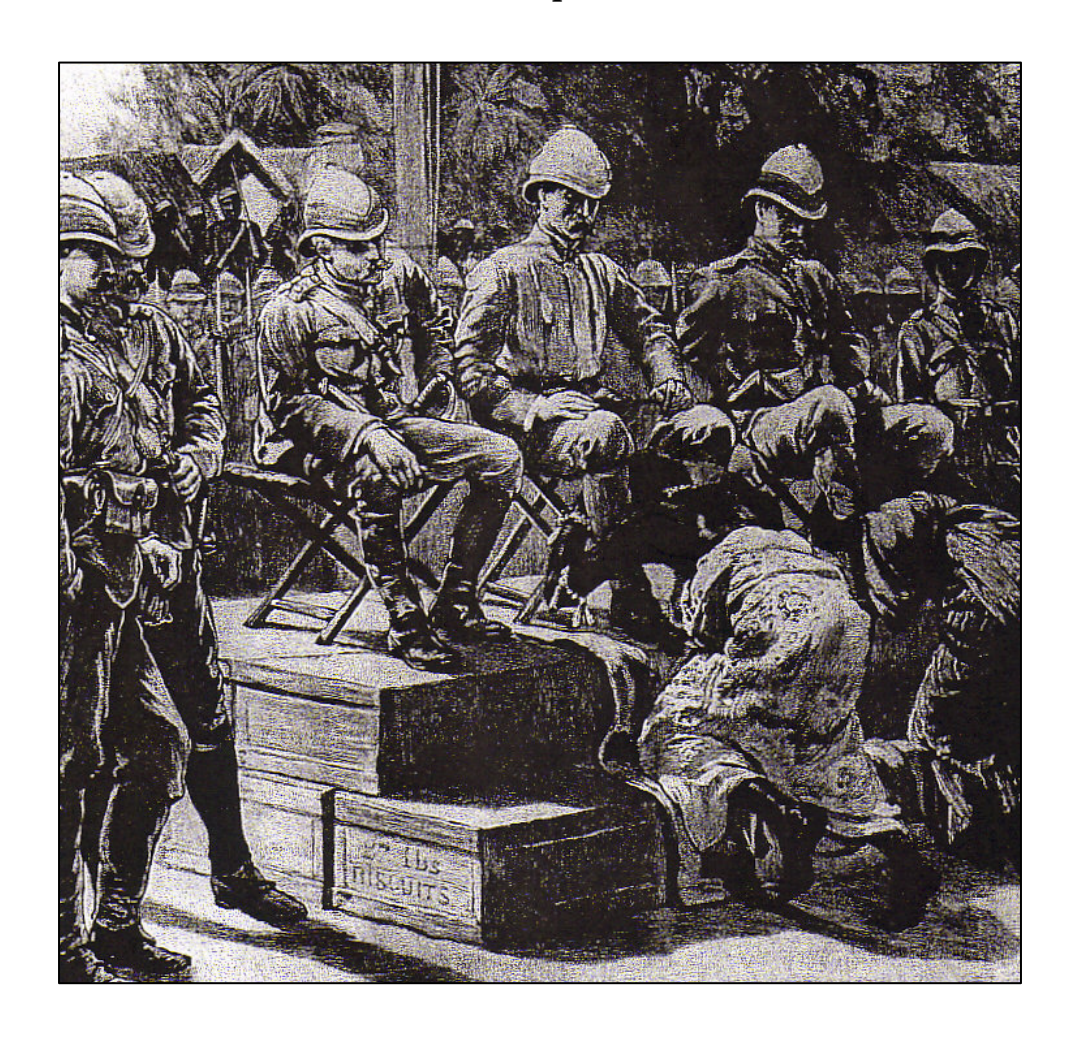
King Prempeh, ruler of the large West African Asante (Ashanti) state, formally submits to British officers in 1896. The Queen Mother (on the right) also makes submission.

The British army occupied the Asante capital of Kumasi (in modern Ghana) in 1896. They forced King Prempeh to formally submit and then exiled him. What conclusions might be drawn about the power-relationships between the people shown? Comparing this image with the one in Student Handout 3.3, what symbolic ways of expressing and reinforcing power relations can be seen?